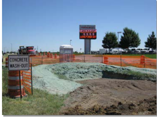
Photograph CWA-3. Earthen concrete washout.