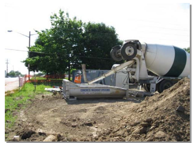
Photograph CWA-2. Prefabricated concrete washout.

Upon termination of use of the washout site, accumulated solid waste, including concrete waste and any contaminated soils, must be removed from the site to prevent on-site disposal of solid waste. If the wash water is allowed to evaporate and the concrete hardens, it may be recycled.