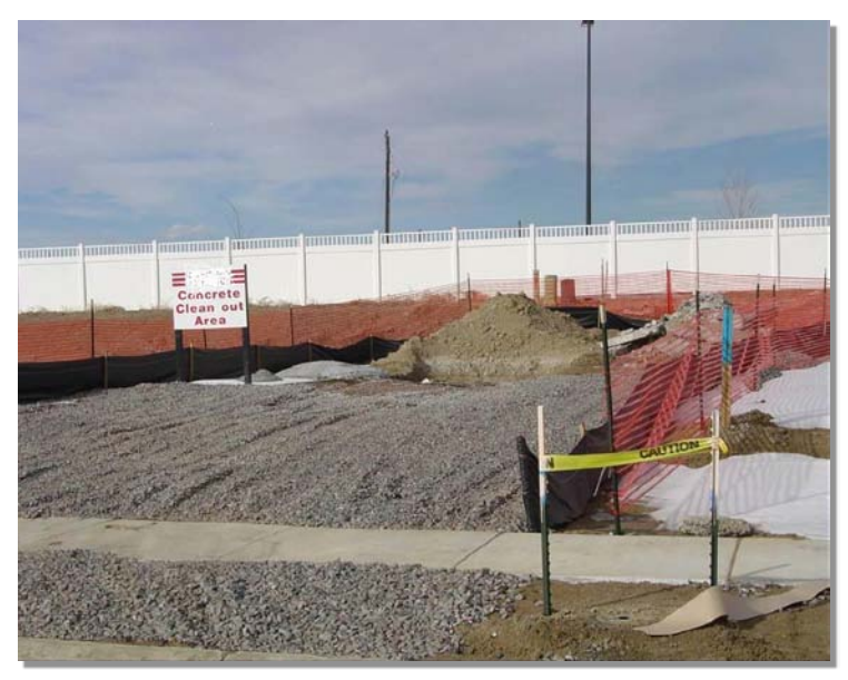
Photograph CWA-1. Example of concrete washout area. Note gravel tracking pad for access and sign.

Concrete waste management involves designating and properly managing a specific area of the construction site as a concrete washout area. A concrete washout area can be created using one of several approaches designed to receive wash water from washing of tools and concrete mixer chutes, liquid concrete waste from dump trucks, mobile batch mixers, or pump trucks. Three basic approaches are available: excavation of a pit in the ground, use of an above ground storage area, or use of prefabricated haulaway concrete washout containers. Surface discharges of concrete washout water from construction sites are prohibited.